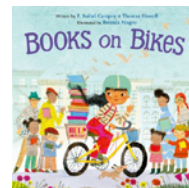
Books on Bikes Isabel F. Campoy