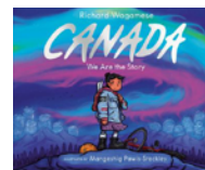
Canada We Are the Story Richard Wagamese